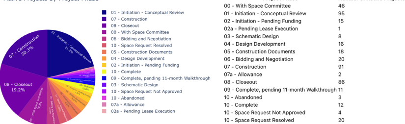
Active Projects by Project Phase

please group active projects by project phase and order them as well. (pie-chart)